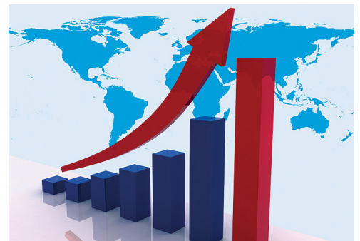
PP-Opt helps in complex production.