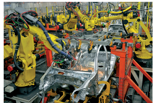
More success by optimized production