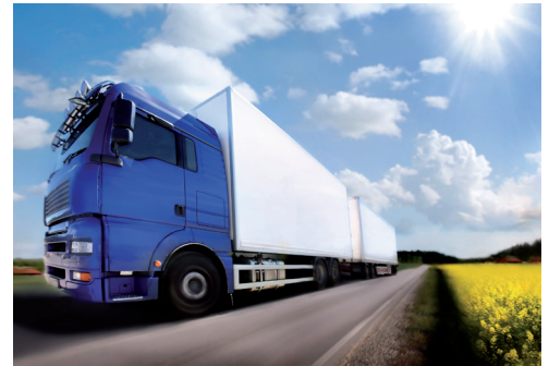
Transports have to be planned in an ideal manner.

DynaTours assists companies and their managing clerks in the optimization of tour planning and thus reduces time and costs. The managing clerk is always in the center of the planning work who is assisted by this piece of software in order to be able to handle a high number of complex tasks. The know-how of the managing clerk combined with the advantages of DynaTours permits fast response to unforeseen modifications. Contrary to many other suppliers, DynaTours permits the optimization in case of a random number of loading and unloading stations (simultaneous loading and unloading of a station!) to be carried out dynamically. Thus, order modifications can be planned at any time during travels in progress.