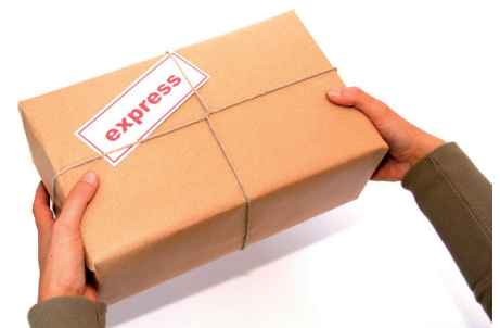
Quick availability is becoming more and more important.