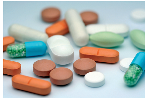
Versatility of the different drugs